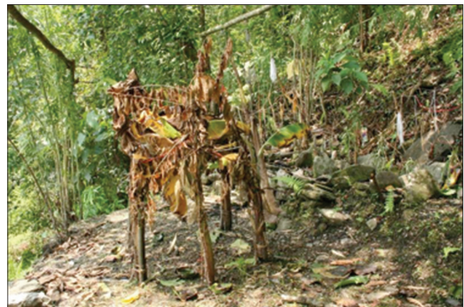
Figure 3 Kali Ma Ka Devithan, Biring, East Sikkim

incomplete aspect of belonging for the Nepalis in Biring who seek to become Sikkimese and subsequently Indian. Though there are a myriad ways by which citizens of Biring construct their belonging, the focus of our research is the role of local sacred sites in such a construction.