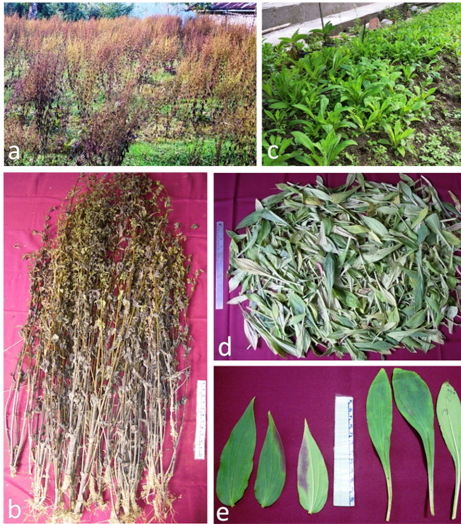
Fig. 1. Fully mature crop cultivated in niche environment (a), fully mature dried harvested plants from niche environment (b), one-year-old ex-situ cultivated plants at lower altitude (c), freshly harvested leaves from one-year-old ex-situ cultivated plants (d) and leaf: sessile leaves of fully mature plant cultivated in niche environment (left) and petiolated leaves of one-year-old ex-situ cultivated plants (right) (e).

of S. chirayita is gradually increasing in domestic and pharmaceutical industries within and outside India. An estimated annual trade of S. chirayita in 2005–2006 was 500–1000 MT (Samaddar et al., 2014) whereas; official import was 97.4 MT (Ved and Goraya, 2007). Sikkim state of Indian is adjoining to Nepal and harbors a very congenial environment for the commercial cultivation of S. chirayita . However, ex-situ cultivation of S. chirayita especially at lower altitudes of Sikkim has not been tried. In the present study, the ex-situ cultivated plants at lower