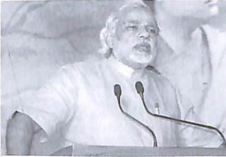
On the cover: Narendra Modi aims to lead the BJP to victory in India's general election this year.