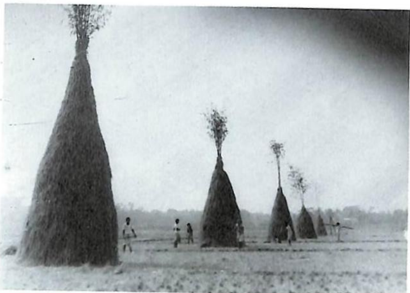
Bhelaghar, a makeshift cottage built for merrymaking during Bhogali Bihu.