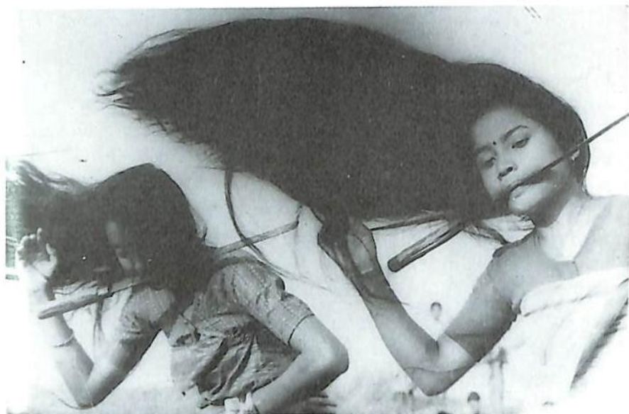
Deodhani , a ritual dance.