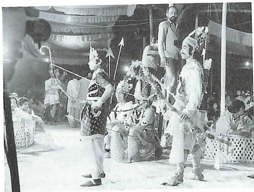
Bhaona , a theatrical performance of a Vaishnava Ankiya Nat or one act play.