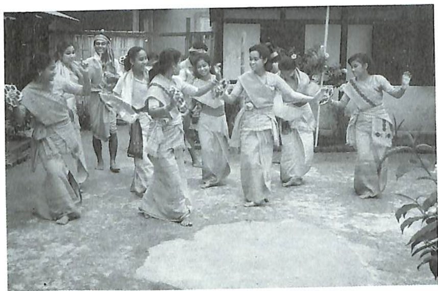
Bodo Maidens performing a Ceremonial Dance.