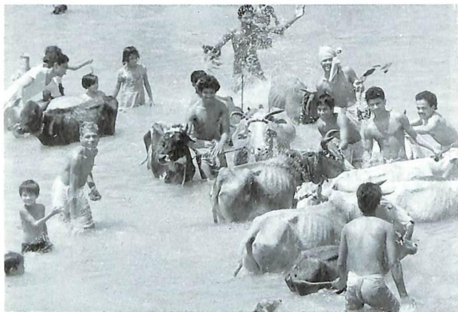
The cattle are given a good wash during Rangali Bihu .