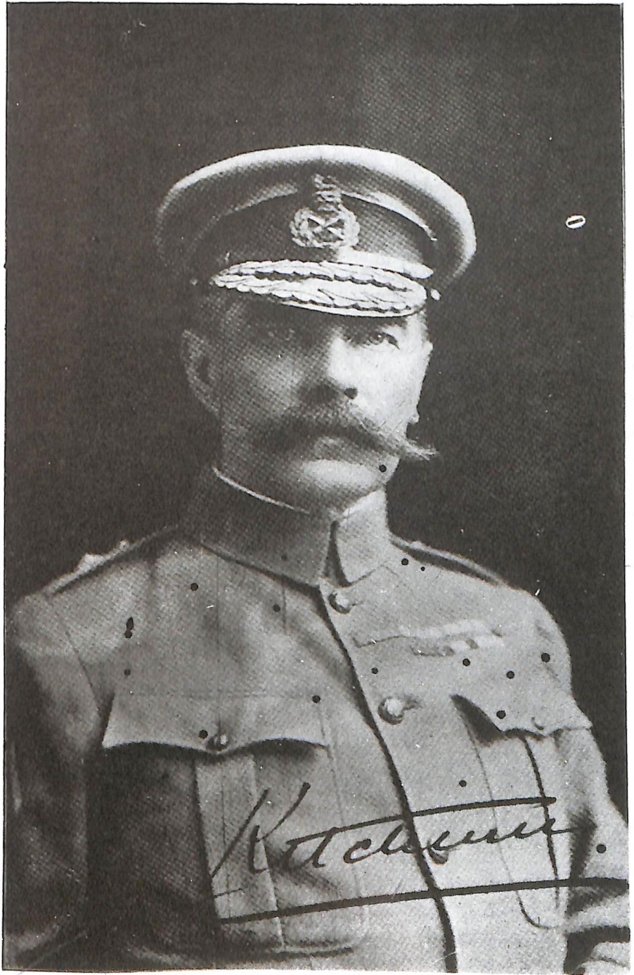
6. HERBERT, VISCOUNT KITCHENER OF KHARTUM, LATE COMMANDER-IN-CHIEF OF THE INDIAN ARMY.