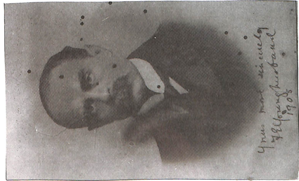
2. COLONEL SIR FRANCIS YOUNGHUSBAND, Commander of the English Expedition to Tibet, Resident in Kashmir.